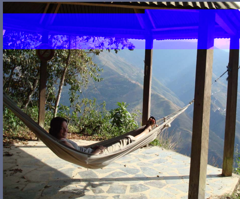
Relaxing in Coroico