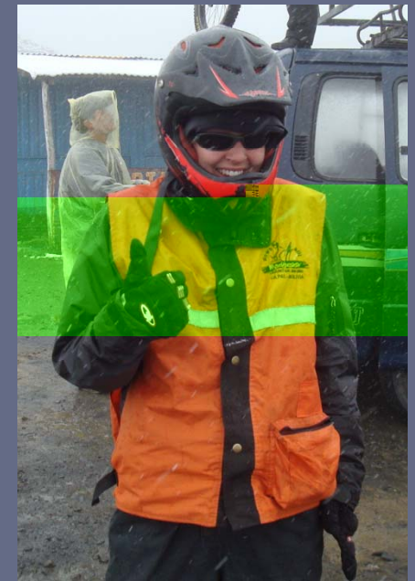
Biking the Death Road